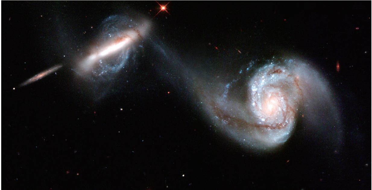
Figure 1: Hubble Space Telescope image of the interacting galaxy pair, Arp 87.