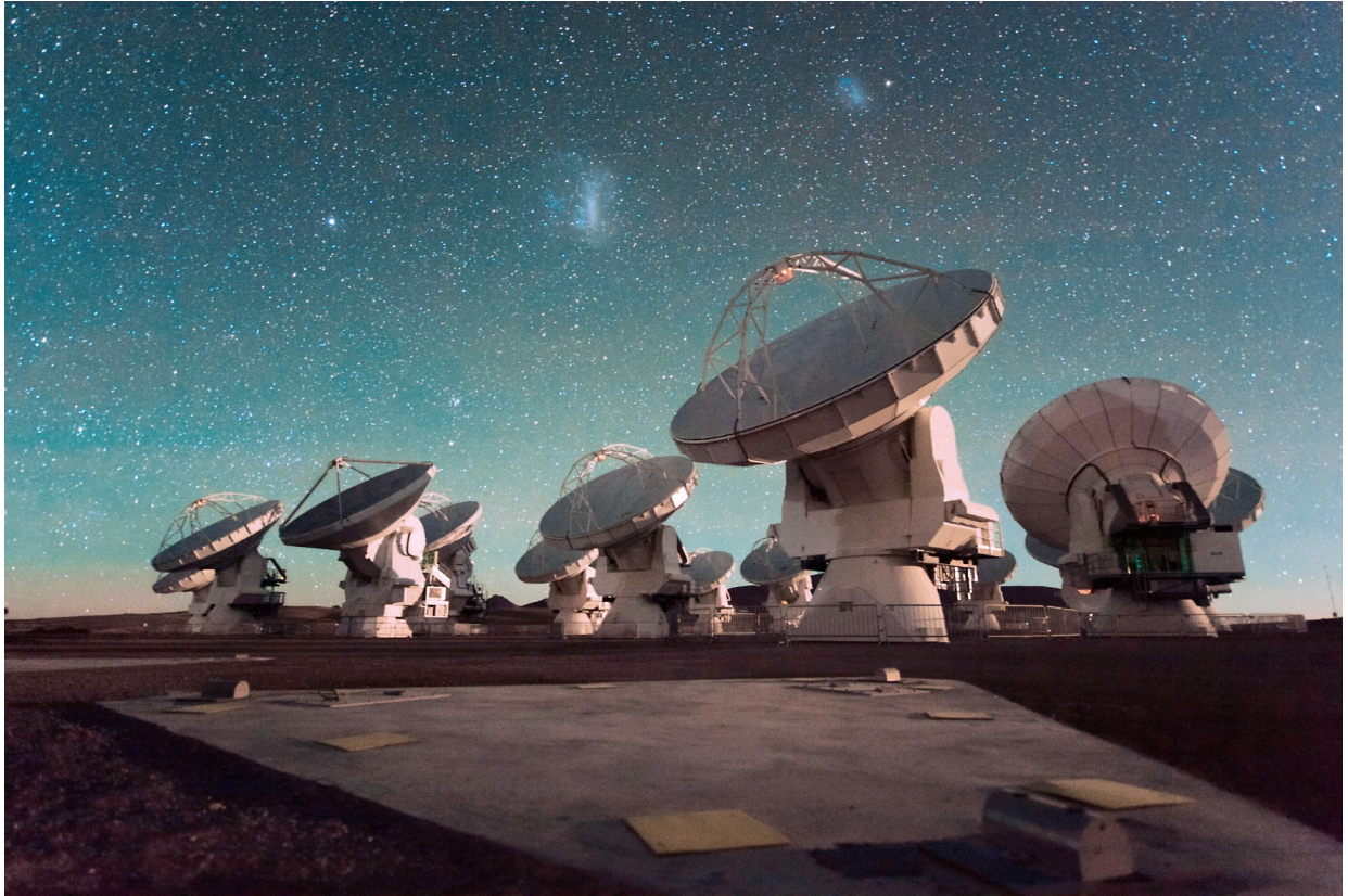
Figure 2: Atacama Large Millimeter/submillimeter Array (ALMA).

molecular gas where stars are forming. Traditionally, carbon monoxide (CO) has been used as a tracer of the total molecular gas content of galaxies that is primarily composed of molecular hydrogen ( H_2 ). Emission from a CO molecule is emitted during transitions from a higher to a lower rotational state, initially excited due to collisions with H_2 molecules. The level of excitation is indicative of the presence of gas at different temperatures and densities. With the spatial resolution of a telescope dependent on the wavelength (or frequency) of light, higher order transitions can produce maps of the gas distribution at greater spatial resolution due to their higher observed frequencies. The aim here is to measure the total CO luminosity with ALMA of a given molecular transition (e.g., J = 2 to 1 ; rest frequency = 230.54 Gigahertz) and convert the luminosity to the mass in molecular gas. The relation between CO